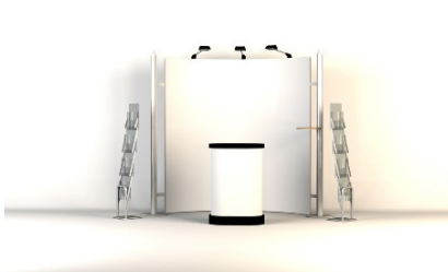
TABLE TOP INFORMATION

ROOM ARRANGEMENT: The tables will be situated along the perimeter of a one of two exhibit areas. The exhibit areas will be used for session breaks, lunch break and the gift prize/raffle. We ask that you exercise restraint in shipping very large table top items. If you have specific requirements, please let us know at least two weeks in advance. A photo of any special display items would help us plan.